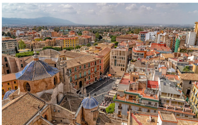
> Cathedral of Murcia