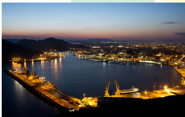
Cartagena Port <